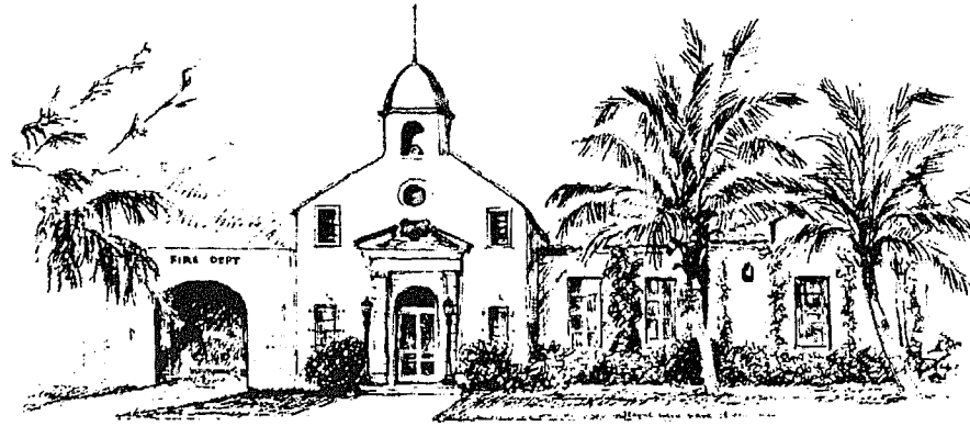
OLD CITY HALL, HOME OF BOCA RATON HISTORICAL SOCIETY