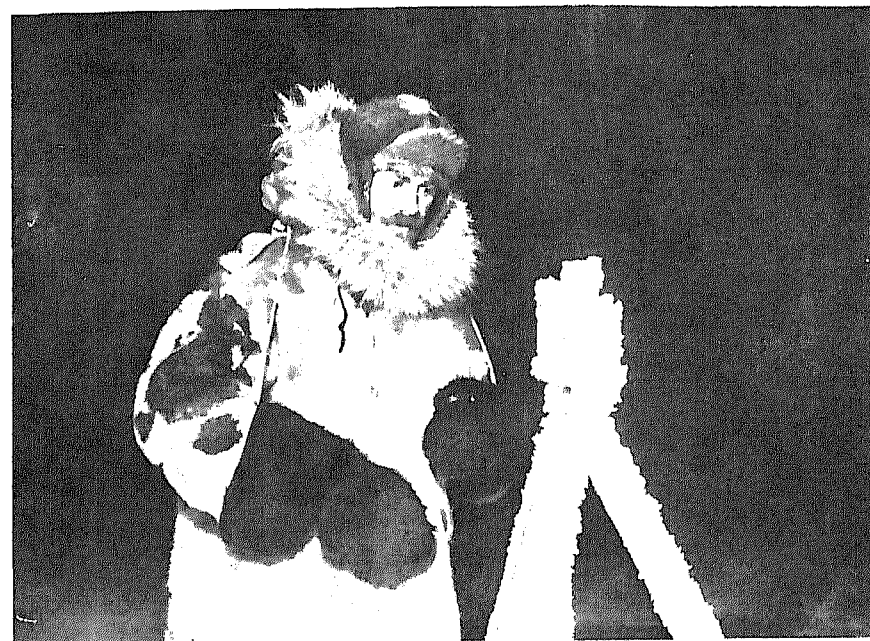
Laurence Gould at Little America, Antarctica, 1929

On Christmas Day 1928, Admiral Byrd sighted the northern edge of the Ross Shelf Ice and on the next day they made their first landing. Gould's task as Second in Command was to supervise the building of the base which they called "Little America." They had brought along several planes. Commander Byrd made a