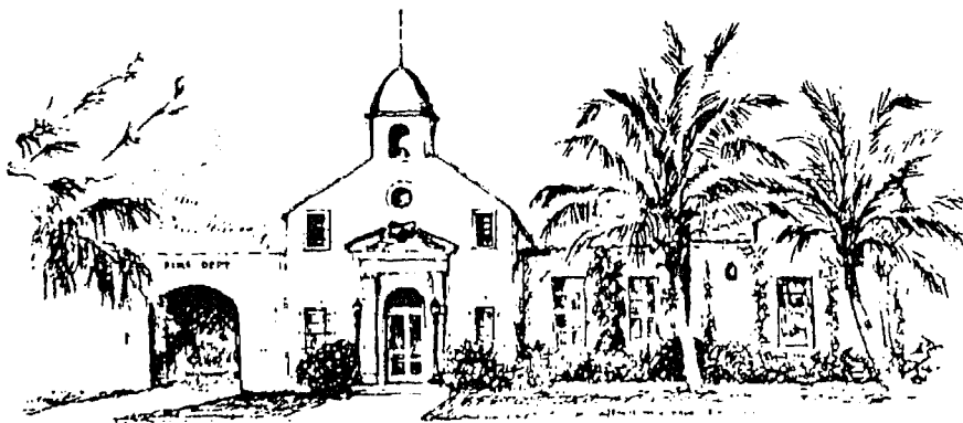
OLD CITY HALL, HOME OF BOCA RATON HISTORICAL SOCIETY