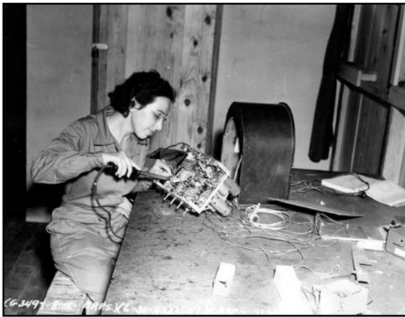
WAC technician at BRAAF 1943. Air Force Historical Research Agency Collection, BRHS&M.

with a cot, we had a shade of some kind with the window, and then the [common] bathrooms were down the hall... but we had a lavatory in our room, a closet, and a cot. That was it... We got orange crates for a bedside table ... And you made do - everybody's in the same shape.” Women and men were dealing with equal conditions, but their pay, benefits, and ranking paled in comparison. Once they became WACs, their status changed significantly, though there was still a discrepancy. A small number of WACs at BRAAF had administrative jobs on base, but the majority of WACs were nurses. 10