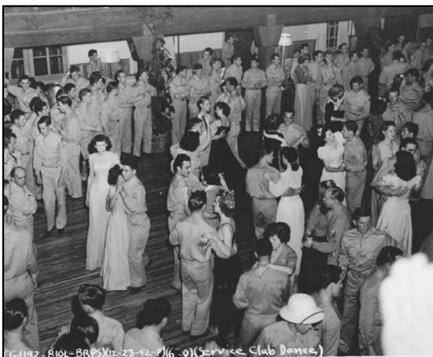
Dance held at Boca Raton Army Air Field December 23, 1943.