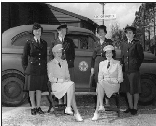
WACs outside BRAAF hospital 1943.

By the end of 1942, the government expanded the number of jobs for women giving “a clear indication of the relationship between the needs of the government and its willingness to accept women in non-traditional positions.” However, the government needed women to fill jobs to support the war effort. The WAAC just happened to be one of the largest fillers. With Daytona Beach being one of the first four WAAC training centers, many of the first true army women ended up in the Sunshine State. With such a large push from the women involved, the WAAC became the Women’s Army Corps (WAC) in July of 1943, making WAC part of the army and giving women a much larger range of benefits. 9